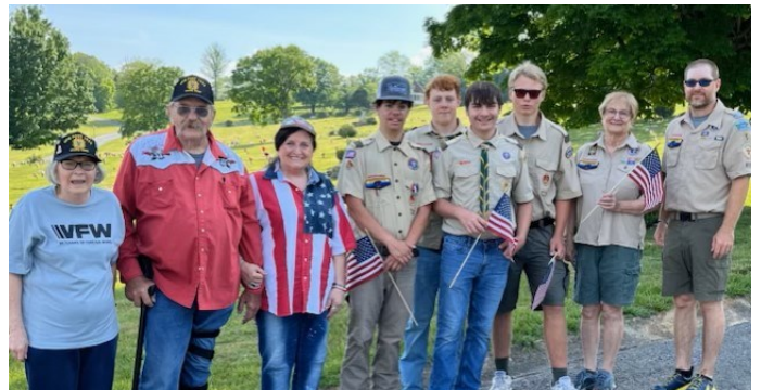
Troop 5 and VFW Members